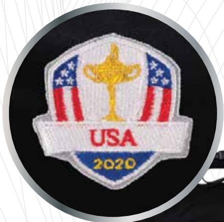
US Ryder Cup Team