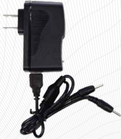
SPARE WALL CHARGER